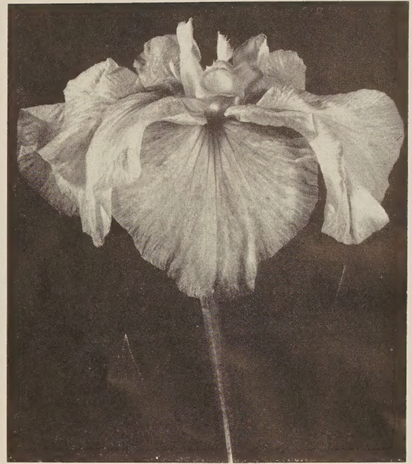
KAEMPFERI JAPANESE IRIS FASCINATION